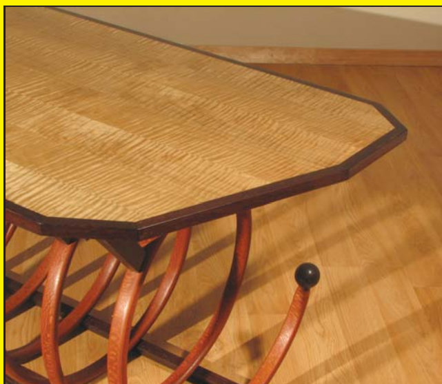
Solid wood spiral coffee table with tiger maple top.

Pontillo also uses different techniques of bending wood, such as steam-bending and glue laminations to create some out of the ordinary shapes, including a solid bent wood lamp with a wood shade that will be featured in his upcoming show.